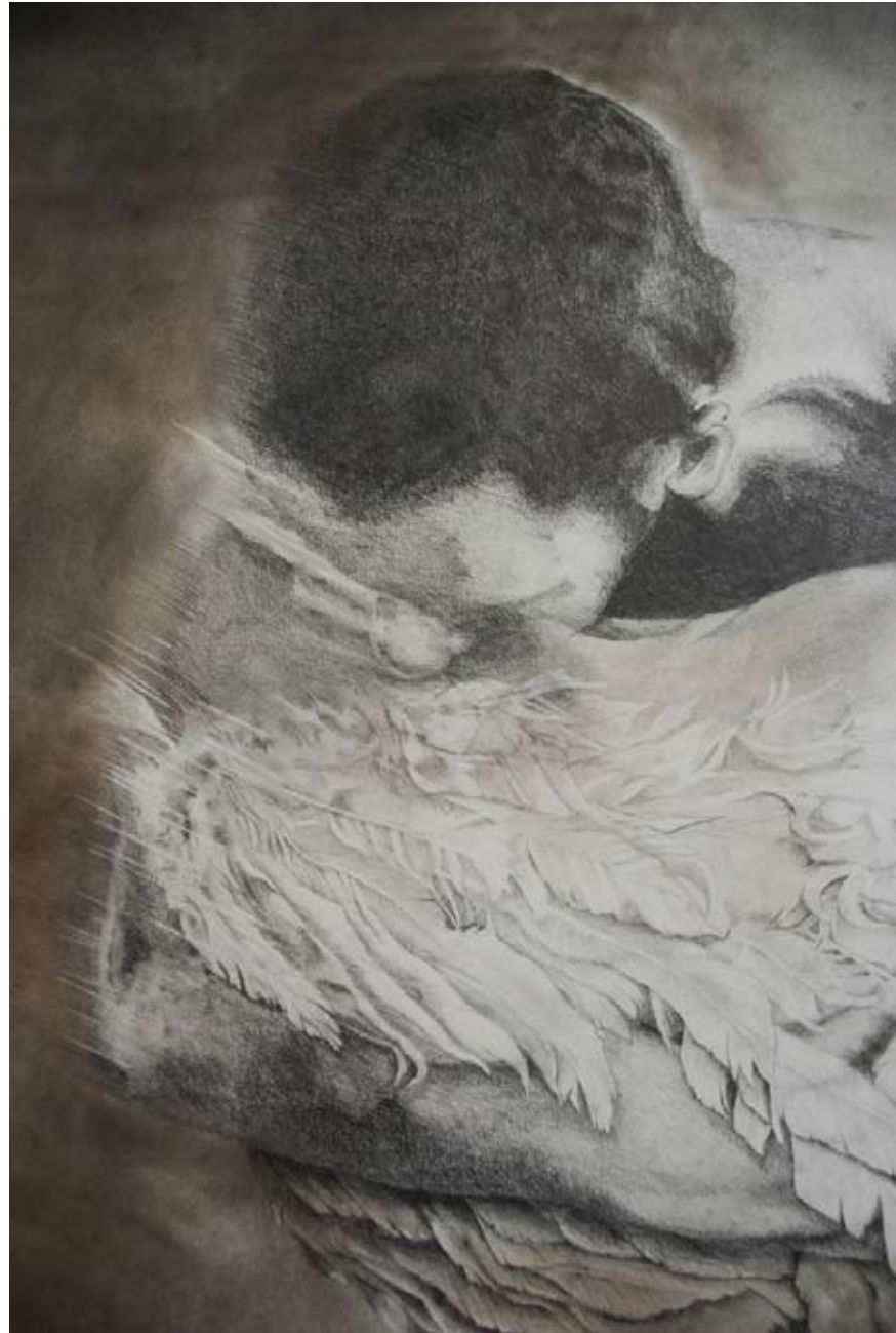
Wrestling God (detail) graphite and soil on paper, 72 x 92 in. (183 x 234 cm), 2012