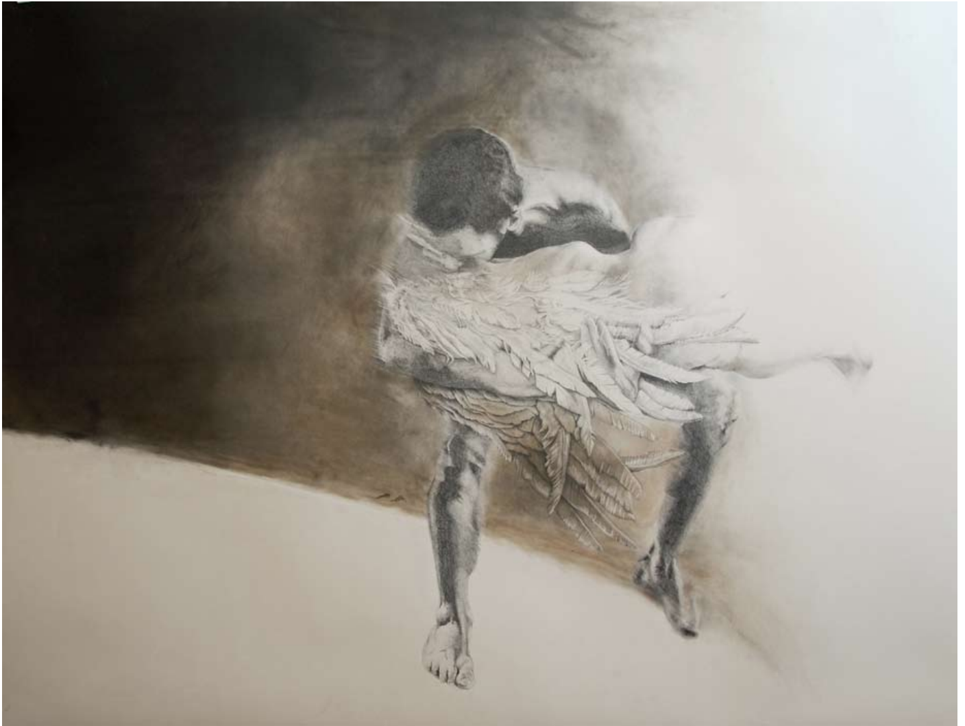
Wrestling God graphite and soil on paper, 72 x 92 in. (183 x 234 cm), 2012